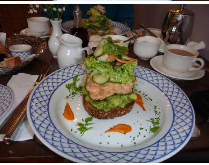
And we even managed to find a nice restaurant or two.